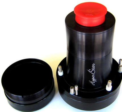
Secondary mirror holder and HyperStar lens (with camera adapter attached)